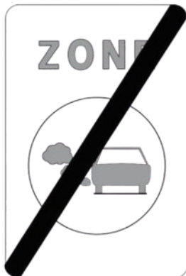
You recognise the LEZ by these signs